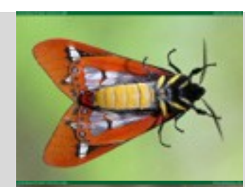
Silk moth (Copaxa escalantei) – Costa Rica